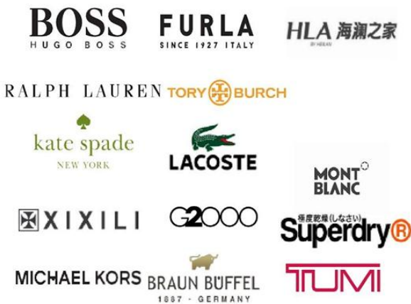
GENTING HIGHLANDS PREMIUM OUTLETS® A GENTING SIMON CENTER