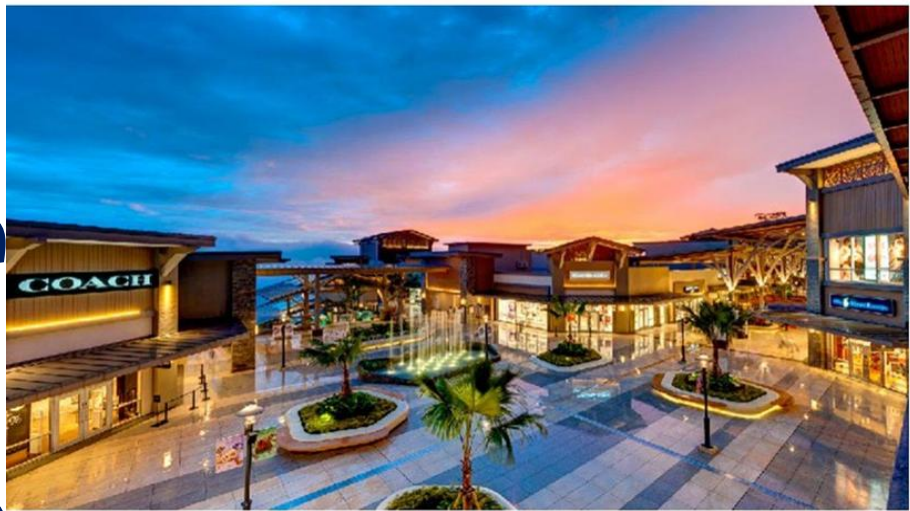
Genting Highlands Premium Outlets® is Southeast Asia's second Premium Outlet Center and the world's first hilltop Premium Outlet Center. Find impressive savings from the selection of more than 150 stores.