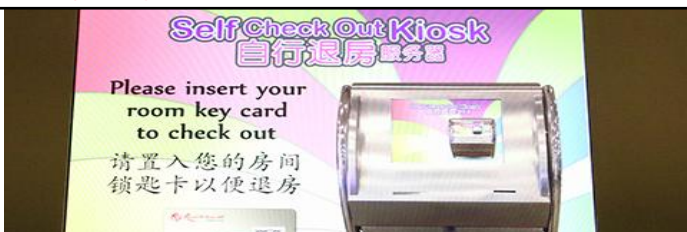
Kiosk Check Out 自助退房