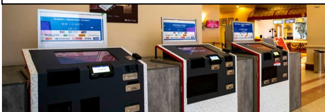
Kiosk Check In 自助登记

于当天下午 1:00 - 4:00 PM 在云顶总站(山顶) 707-INC 一号柜台取票