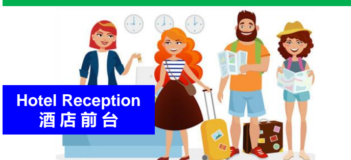
Hotel Reception 酒店前台

If Kiosk Not Available or System Error 如果自助服务终端不可用或系统错误 24 Hr Hotel Reception Check In 二十四小时酒店前台办理入住手续 Kiosk Accept Credit Card Payment Only 自助服务终端只接受信用卡付费