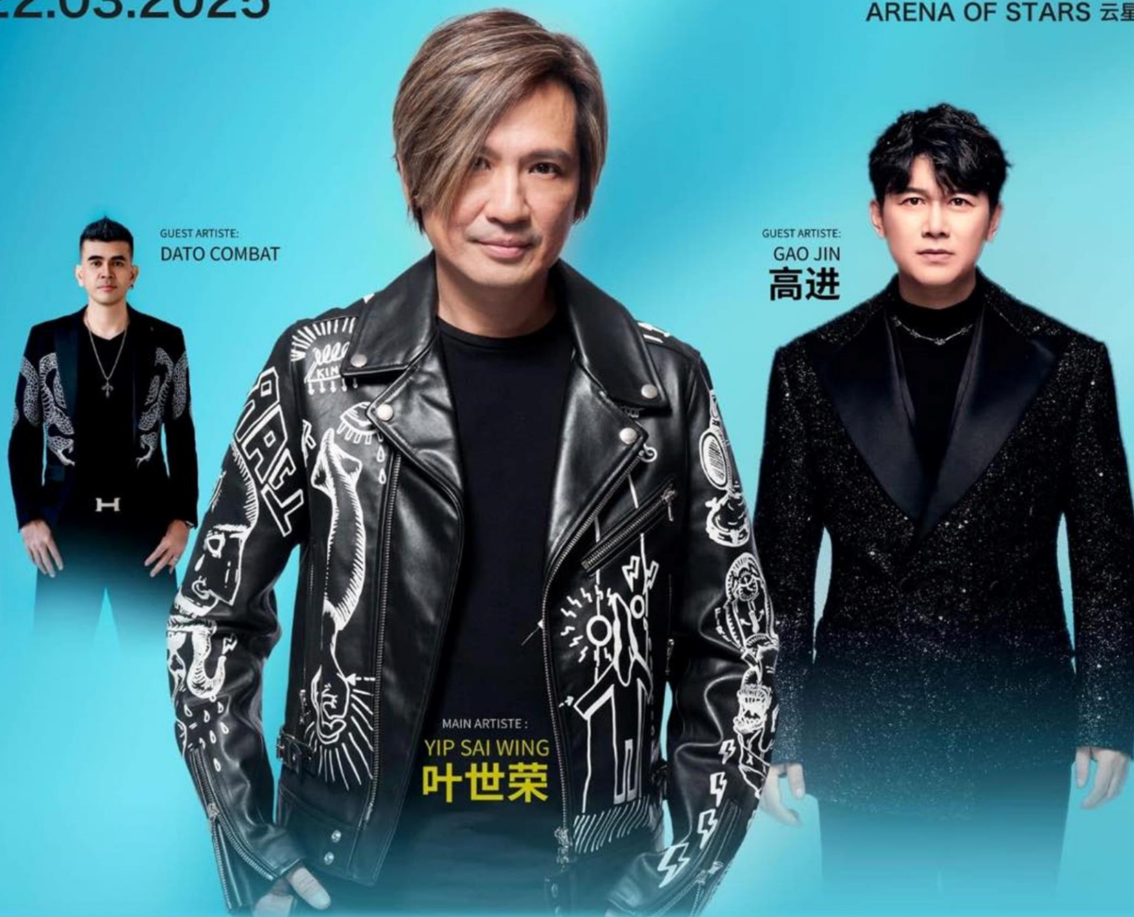
GUEST ARTISTE: DATO COMBAT