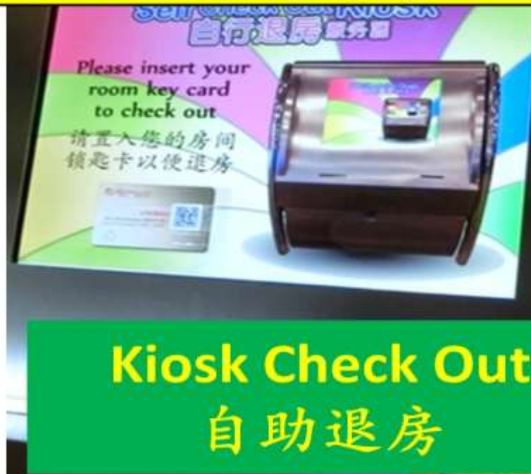
Kiosk Check Out 自助退房