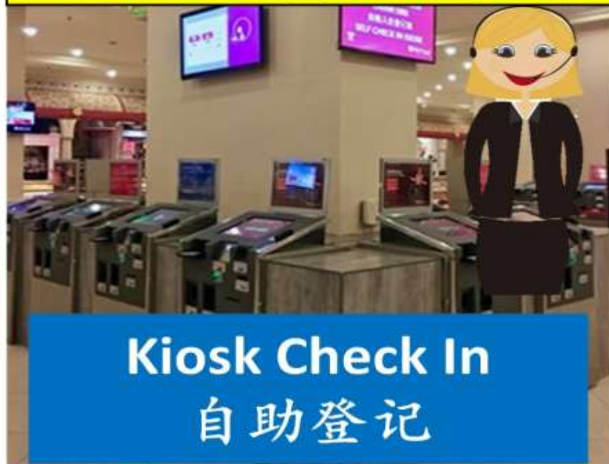
Kiosk Check In 自助登记

当天下午 1:00 - 4:00 在云顶山顶巴士总站 BT3 707-Inc 柜台 一号取票