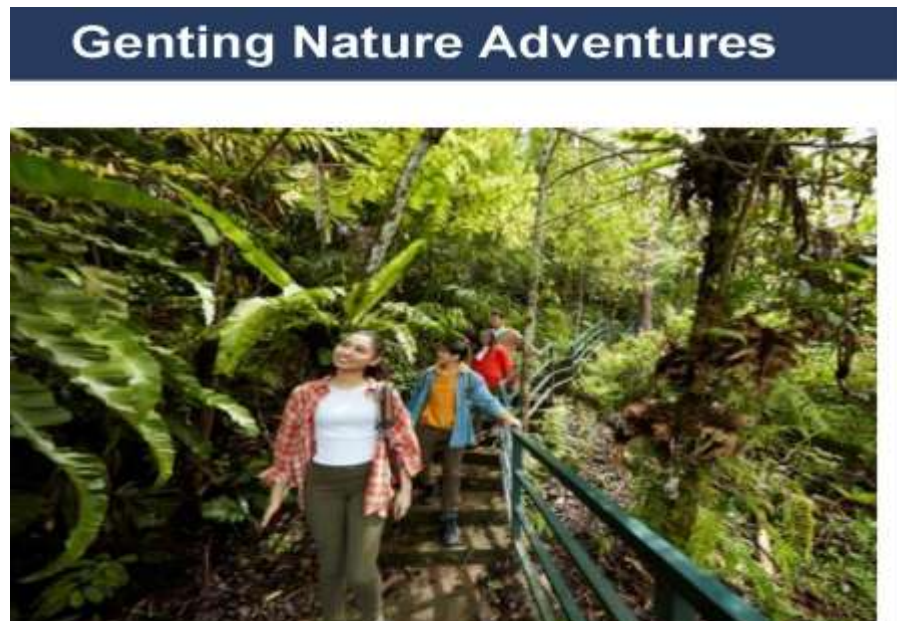
Genting Nature Adventures