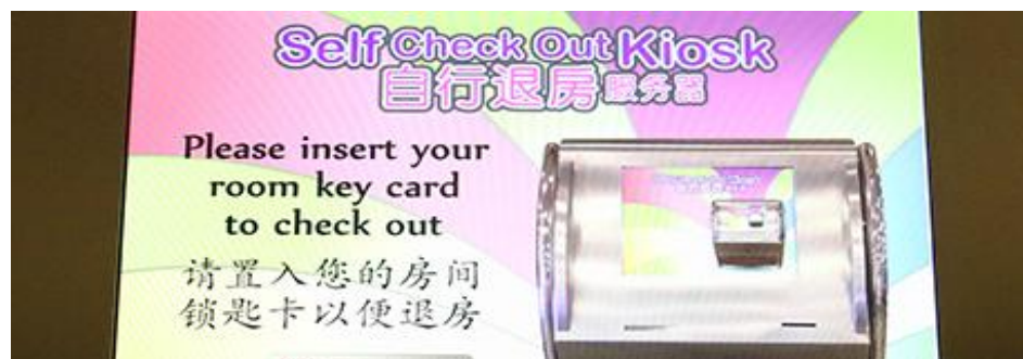
Kiosk Check Out 自助退房