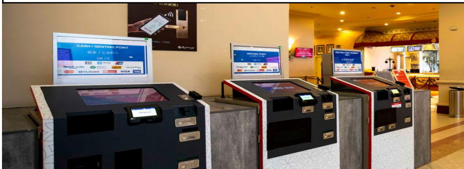
Kiosk Check In 自助登记

于当天下午 1:00 - 4:00 PM 在云顶总站 (山顶) 707-INC 一号柜台取票