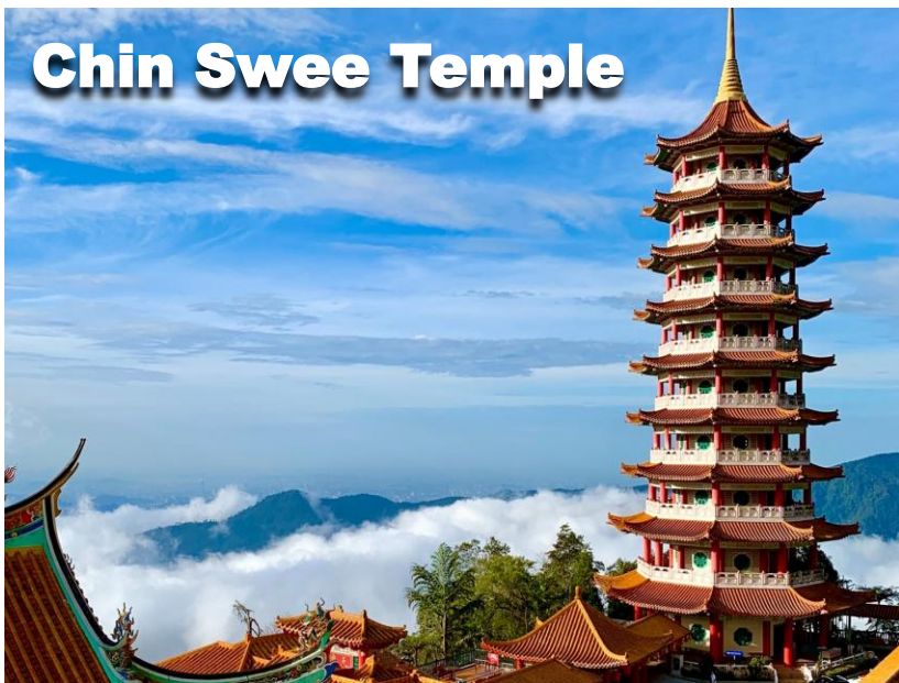
Chin Swee Temple