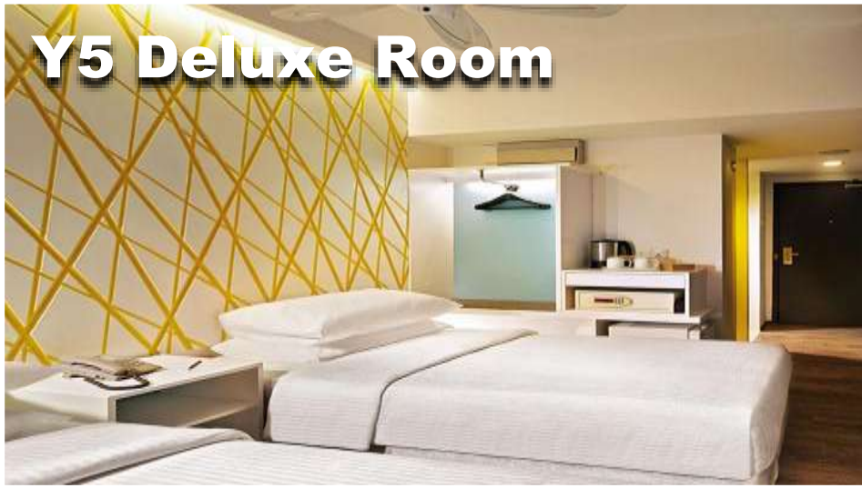
Y5 Deluxe Room