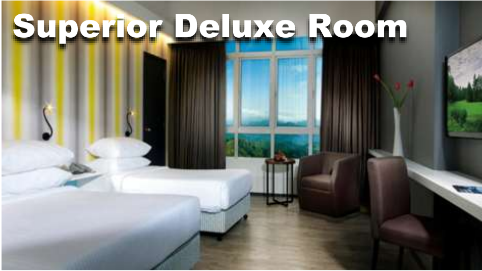
Superior Deluxe Room