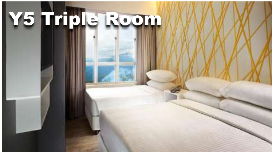
Y5 Triple Room